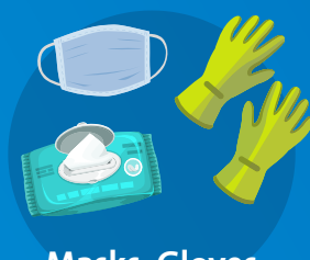
Masks, Gloves & Wipes