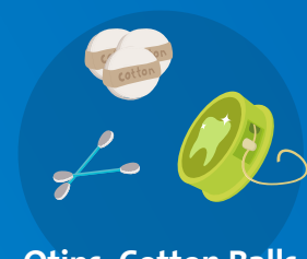
Q-tips, Cotton Balls & Dental Floss