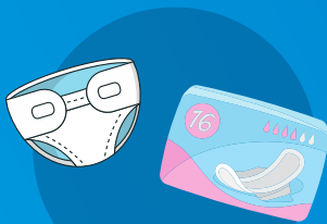
Diapers & Feminine Hygiene Products