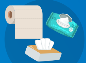
Flushable Wipes, Tissues & Paper Towels