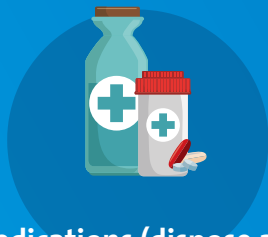
Medications (dispose at a drug take-back location)